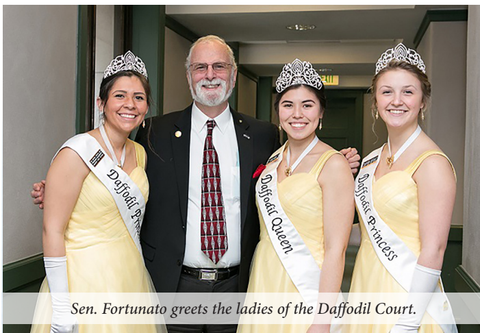
Sen. Fortunato greets the ladies of the Daffodil Court.

I hope you will go to my webpage, senatorphilfortunato.com , watch the videos and share them with your family, friends and neighbors.