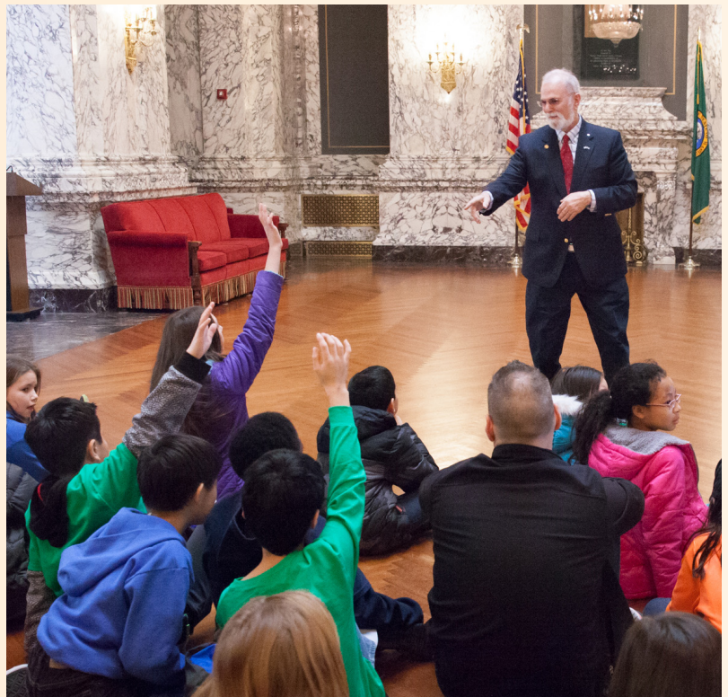
Sen. Fortunato answers questions from student visitors.